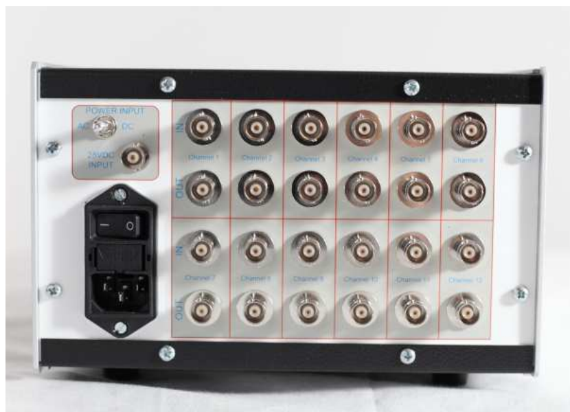
AMP-12BB-J back panel