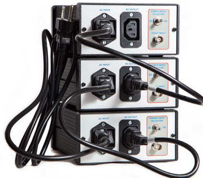
AMP-1BB-AE "power jumper"