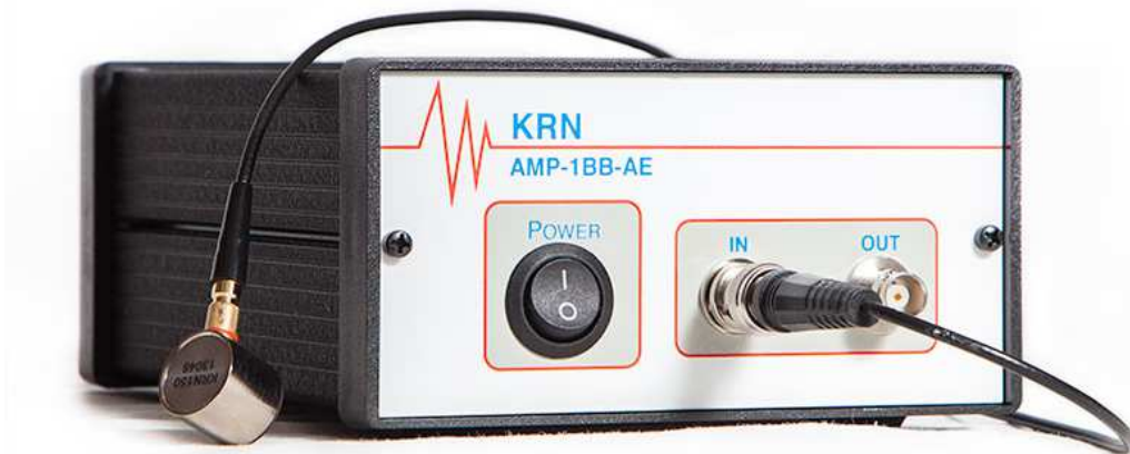
AMP-1BB-AE with KRN150 sensor

The KRN AMP-1BB-AE is a single channel broadband preamplifier designed to interface standard non-preamplified sensors to your Data Acquisition System or AE Test System for signal capture and analysis. The wide frequency range allows use with a variety of sensors including the KRNBB-PCP pulsable broadband sensor, the KRN150, KRNm500, and KRN300, among others. The AMP-1BB-AE is also compatible with most non-preamplified sensors from other manufacturers.